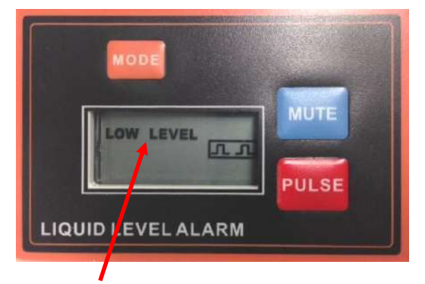
Intermittent audible alarm mode displayed.